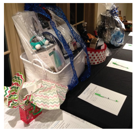
Silent Auction Baskets