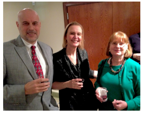
Networking before dinner!