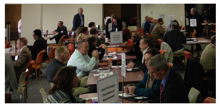
Day two one-on-one meetings