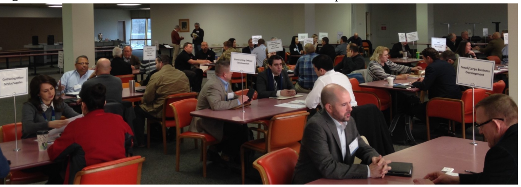
Day two one-on-one meetings